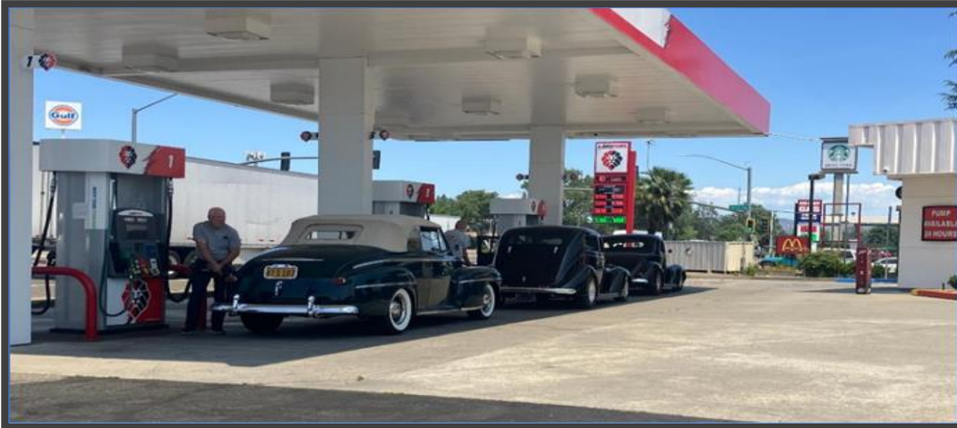
Cars gassing up for Burney!

Meetings are held on the 2nd Tuesday of every month at 7 PM at Round Table Pizza- Exit Hwy 12 & Stony Point Road to 2065 Occidental Road, Santa Rosa. All interested V8-ers are invited to attend! This newsletter is a monthly publication of Redwood Empire RG # 27 of the Early Ford V8 Club of America. Other Regional Groups may reprint material, provided proper credit is given.