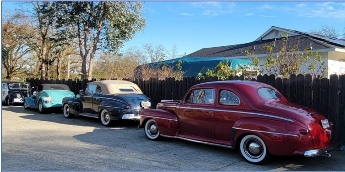
Getting the cars out to start a new year!

Meetings are held on the 2nd Tuesday of every month at 7 PM at Round Table Pizza- Exit Hwy 12 & Stony Point Road to 2065 Occidental Road, Santa Rosa. All interested V8-ers are invited to attend! This newsletter is a monthly publication of Redwood Empire RG # 27 of the Early Ford V8 Club of America. Other Regional Groups may reprint material, provided proper credit is given.