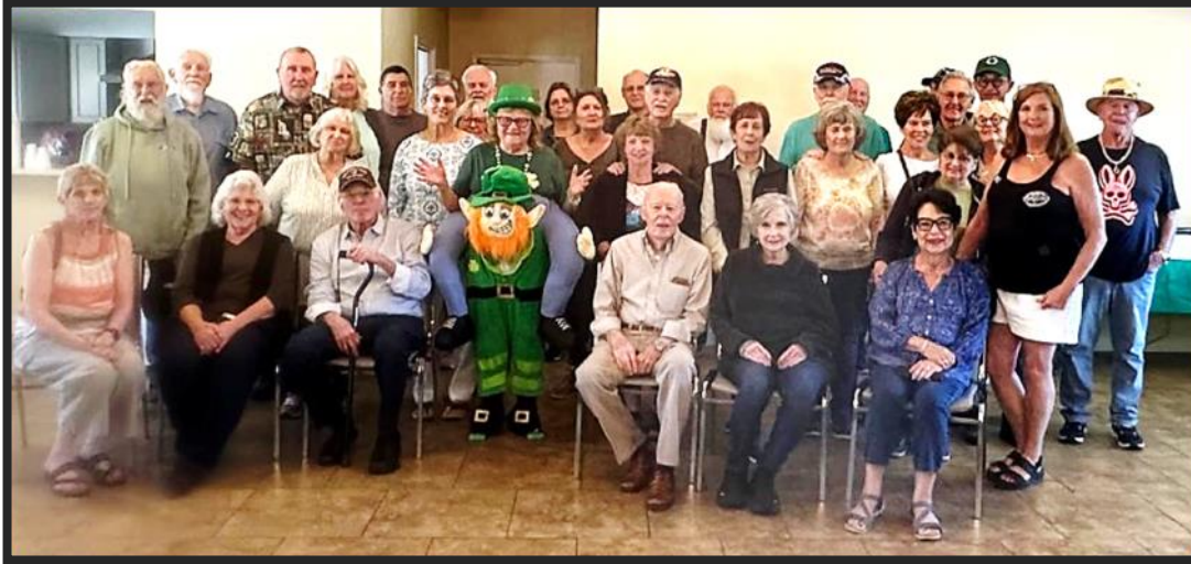
Corned Beef Lunch 2026

Meetings are held on the 2nd Tuesday of every month at 7 PM at Round Table Pizza- Exit Hwy 12 & Stony Point Road to 2065 Occidental Road, Santa Rosa. All interested V8-ers are invited to attend! This newsletter is a monthly publication of Redwood Empire RG # 27 of the Early Ford V8 Club of America. Other Regional Groups may reprint material, provided proper credit is given.