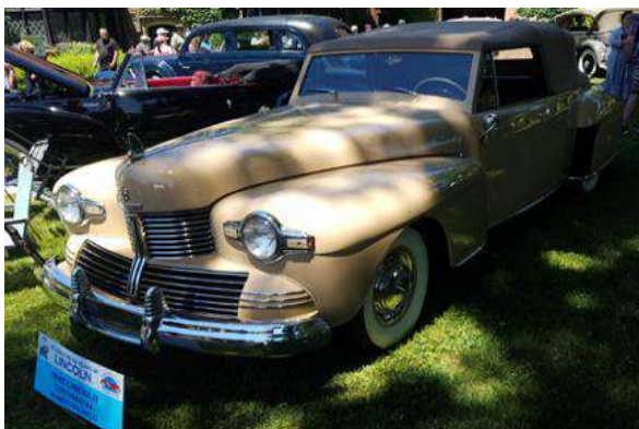
1942 Lincoln Continental