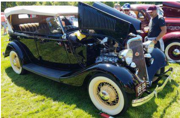
1934 Ford Phaeton

Because it is the 100 th anniversary of the Lincoln, there was a nice collection of Lincolns. The Lincolns of the 30's and 40's were especially noteworthy. However, the majority of cars displayed were muscle cars of the 60's and 70's, with a scattering of Corvettes and a few exotics. (Think Ferrari or a side-by-side pair of Deloreans.) As I said, it was an unusual car show and we spent about four hours walking among the cars displayed on a large grass field.