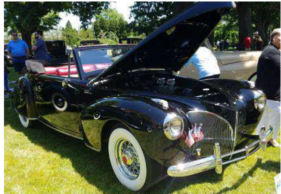
1941 Lincoln Continental